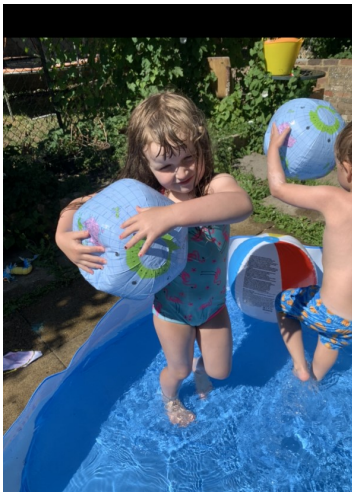
Outside with inflatable globes talking about all the different places in the world and where they are!