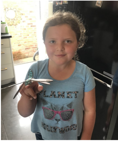
Fantastic bug making!