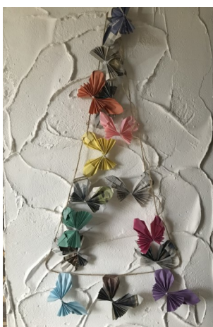
Brilliant Design and Technology home learning.