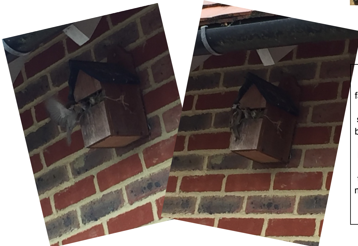
We have some new friends at school, a family of sparrows have chosen to nest in the school car park! It has been amazing watching mum and dad come back and forth feeding the babies who are there waiting with their mouths open. We have our very own 'Nature Watch' in Alfriston.