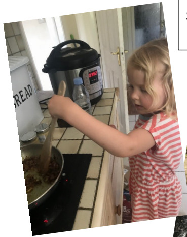
Busy doing some Science and Cookery home learning