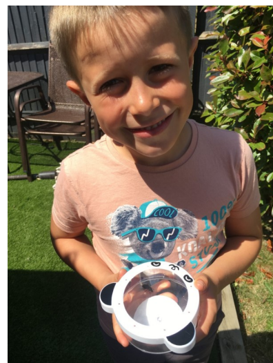
Great fun going on a bug hunt!